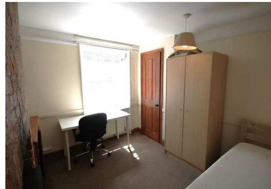
Bedroom 2 9'0" x 9'3" (2.76 x 2.82)